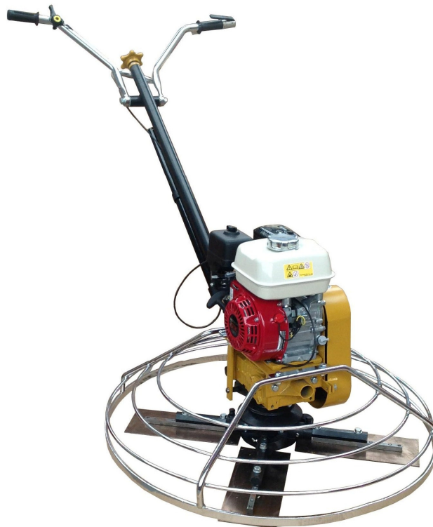
Model PT 900