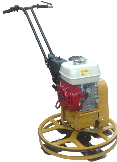
Model PT 600