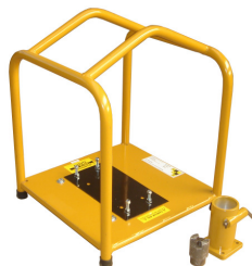
Fixed Heavy Duty Frame

Specifications are subject to change without prior notice