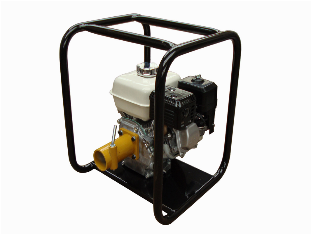
Honda Petrol Fixed Frame