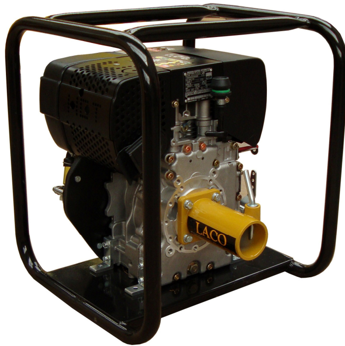
Hatz Diesel Fixed Frame